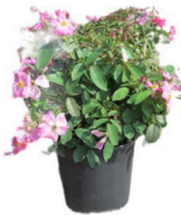
Pink Nearly Wild Rose