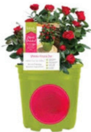
Red knock out rose